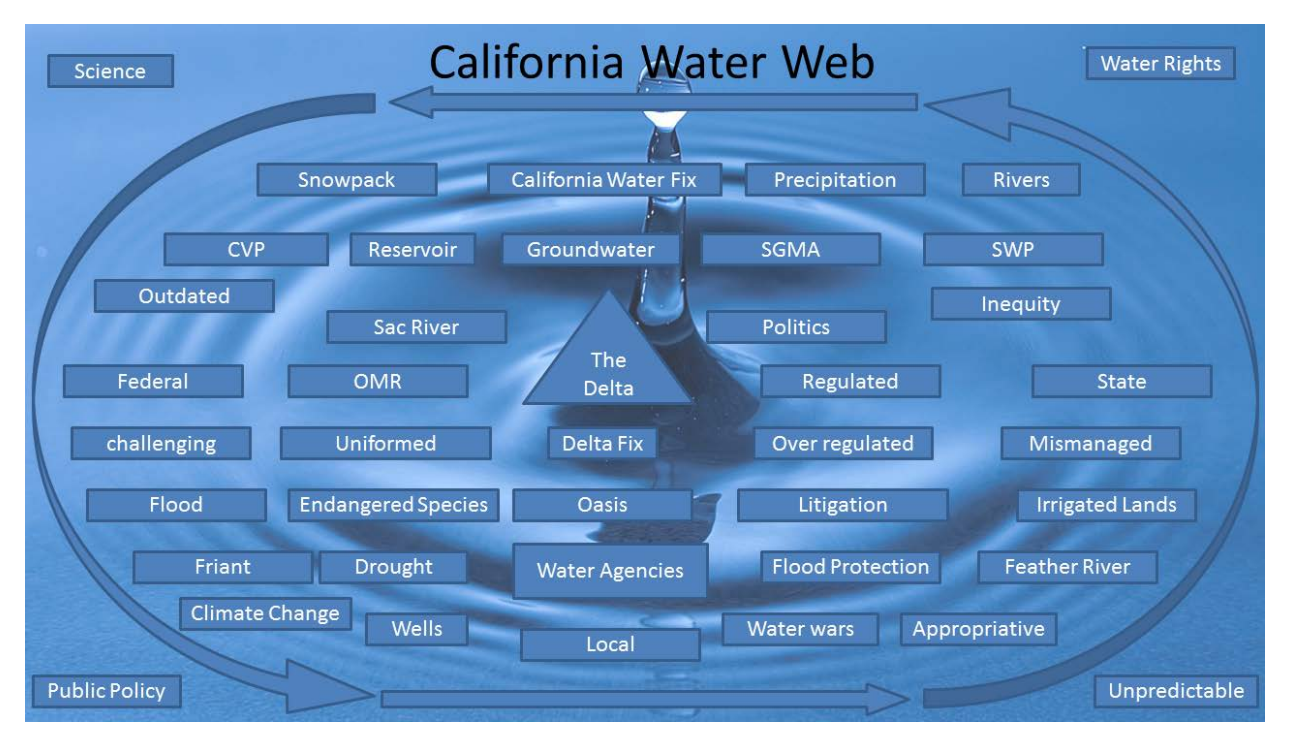
Figure 7-1 - California Water Web (Edstrom, 2016)

Natural resources disputes often prove to be uniquely challenging because they involve fundamental conflicts between stakeholder groups that have differing goals for the same resource (Biber, 2013a). The result is an inter-related web of stakeholders, processes and priorities ( Figure 7-1 ).