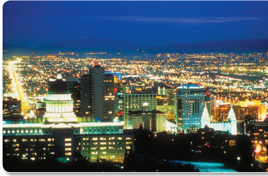
Glen Canyon Dam is an important source of electricity in the Southwest. Above, Salt Lake City.

In 1996, 2004 and 2008, scientists conducted one weeklong and 2-1/2 days of steady flows of 45,000 to 42,000 cubic