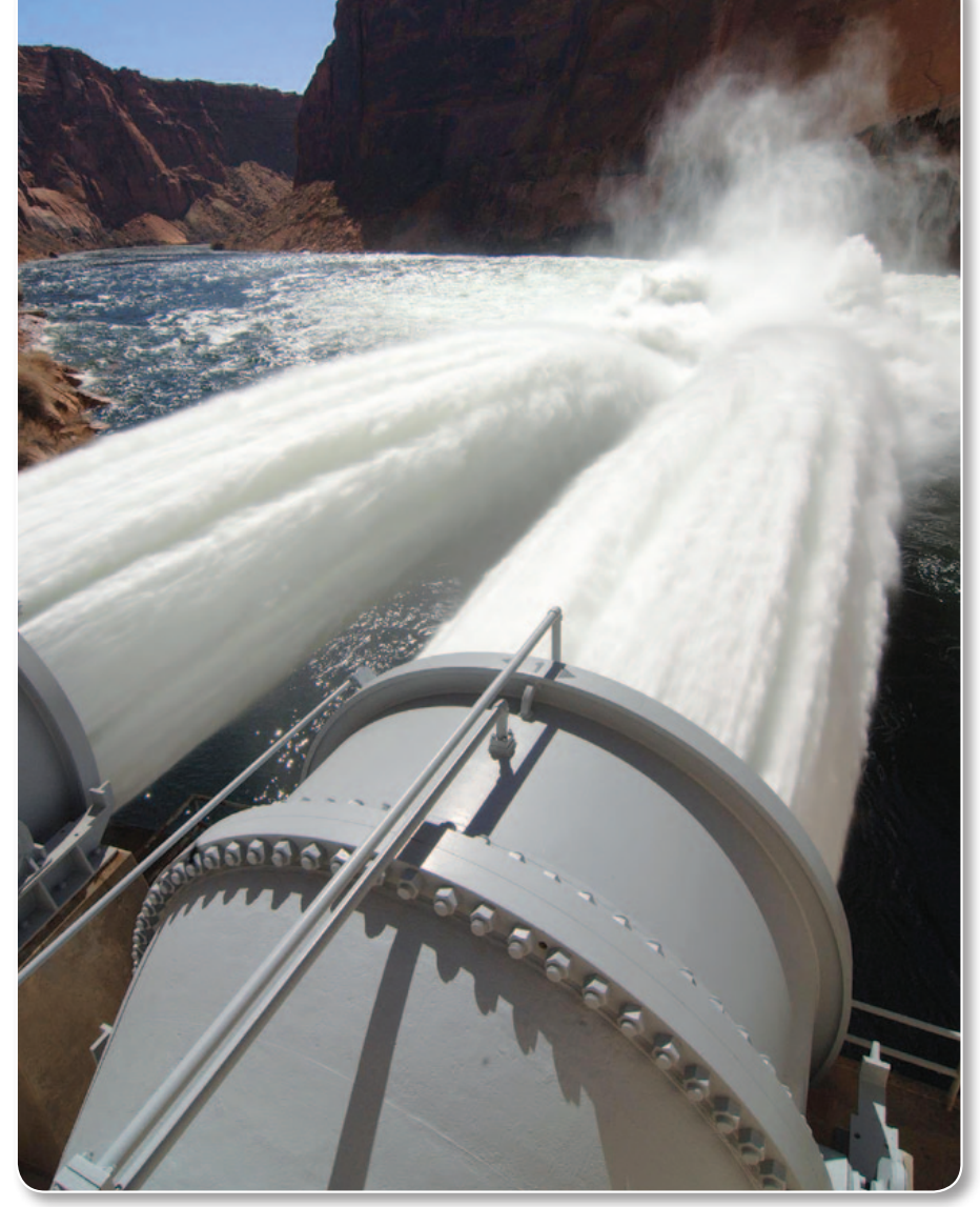
Scientists conducted high-flow, flood-like releases from Glen Canyon Dam in 1996, 2004 and 2008.

2010 paper published in the Columbia Journal of Environmental Law questioned the success of the AMP, saying it has "failed to stabilize or otherwise improve the quality of the fragile downstream ecosystem," and "has been unable to make substantial progress toward resolving the significant resource conflicts at the heart of the Dam's operations."