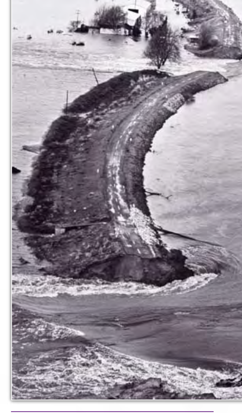
Top Photo: Levee failure in the Sacramento-San Joaquin Delta's Tyler Island during the 1986 Flood.