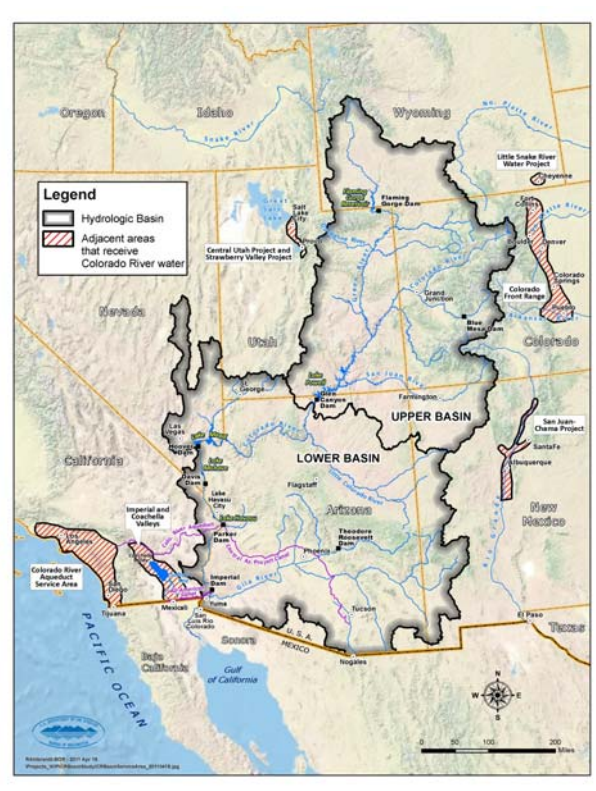
Figure 1. Map of the Colorado River hydrologic basin and areas adjacent to the hydrologic basin that receive Colorado River water.

The states could not agree on how the waters of the Colorado River Basin should be allocated among them, so then Secretary of Commerce, Herbert Hoover, suggested the basin be divided into an upper and lower half, with each basin having the right to develop and use 7.5 million acre-feet (maf) of river water annually. This approach reserved water for future upper basin development and allowed planning and development in the lower basin to proceed.