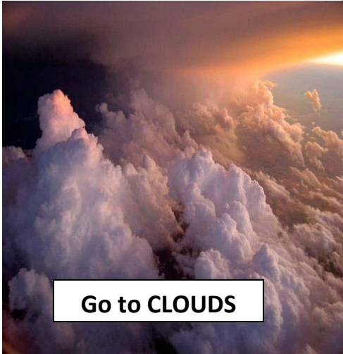
Go to CLOUDS