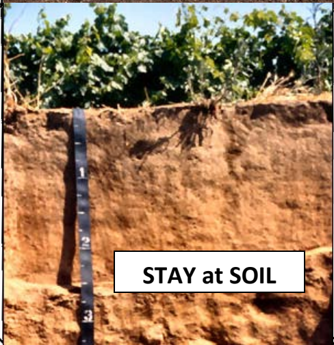
STAY at SOIL