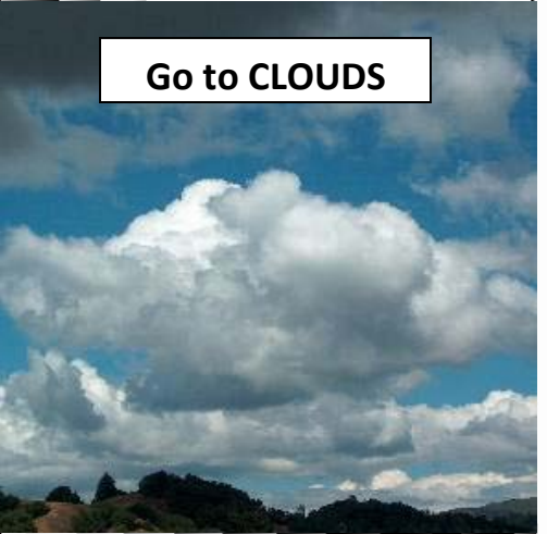
Go to CLOUDS