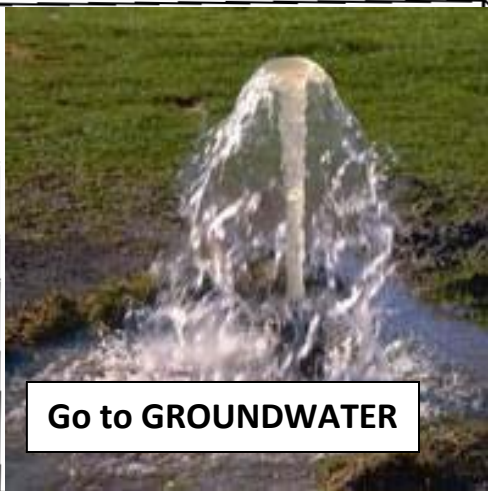
Go to GROUNDWATER