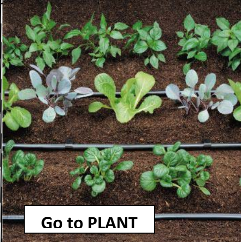
Go to PLANT