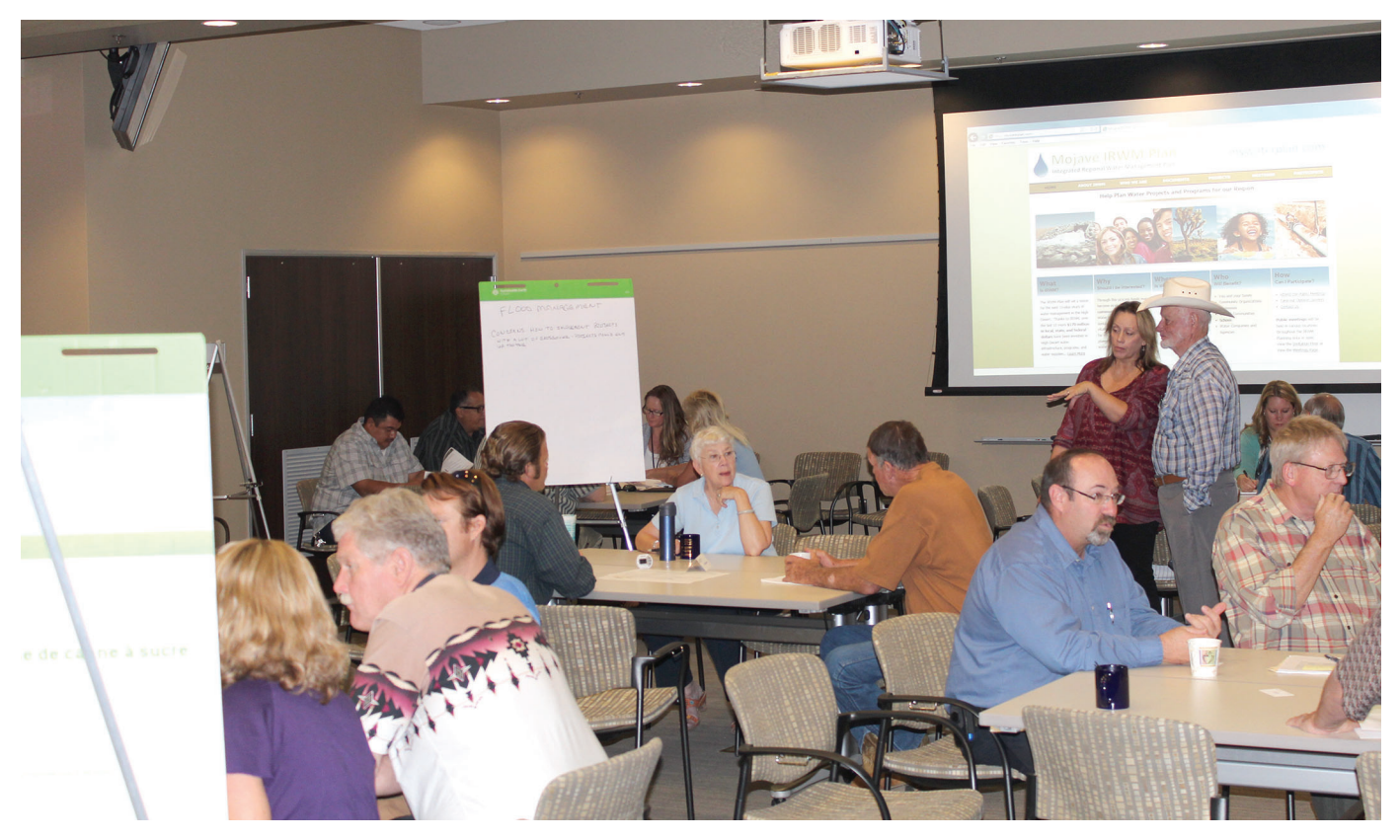
Photo caption. Community engagement is crucial to hear local questions and concerns.

Moving from identifying a problem to achieving a solution often requires additional help. To compete for construction funding requires significant and often costly up-front work — feasibility studies, design, engineering and environmental review. All Proposition 1 funding regions have set aside money to assist in project development.