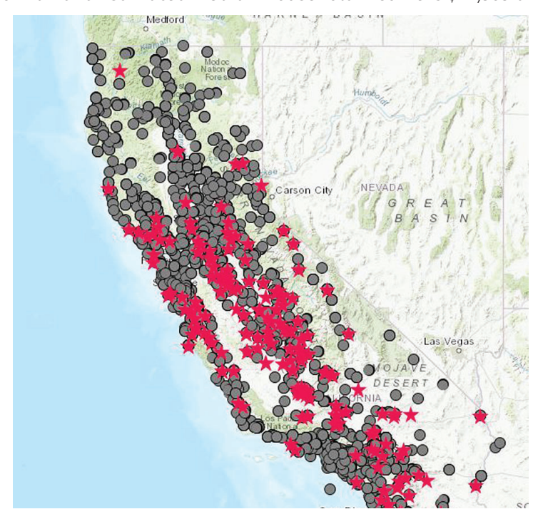
Photo caption. Water systems that were out of compliance with state drinking water standards as of December 2018 are marked by red stars.

Note: California 2020 Estimated Median Household Income is $79,353 and 80% is $63,482