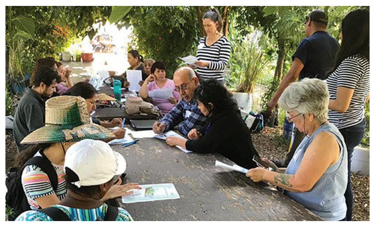
Photo caption. The range of communities consulted included middle class suburban households, low-income residents and those experiencing homelessness.

While water providers put a lot of effort in guaran- teeing clean drinking water, the report said they should work directly with community-based organizations to hear and respond to localized concerns people have about their tap water.