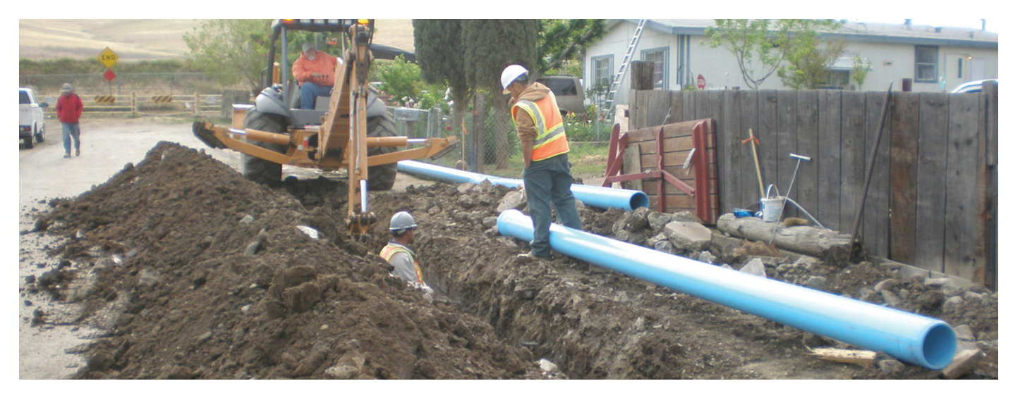
Photo caption. Grant funding is used to improve water system connectivity.

Labor statistics. Many of the people are from communities in southern Mexico and speak languages indigenous to that region. In addition to their distinct languages, they arrive in the United States with unique cultural beliefs and in some cases a reluctance to engage with government.