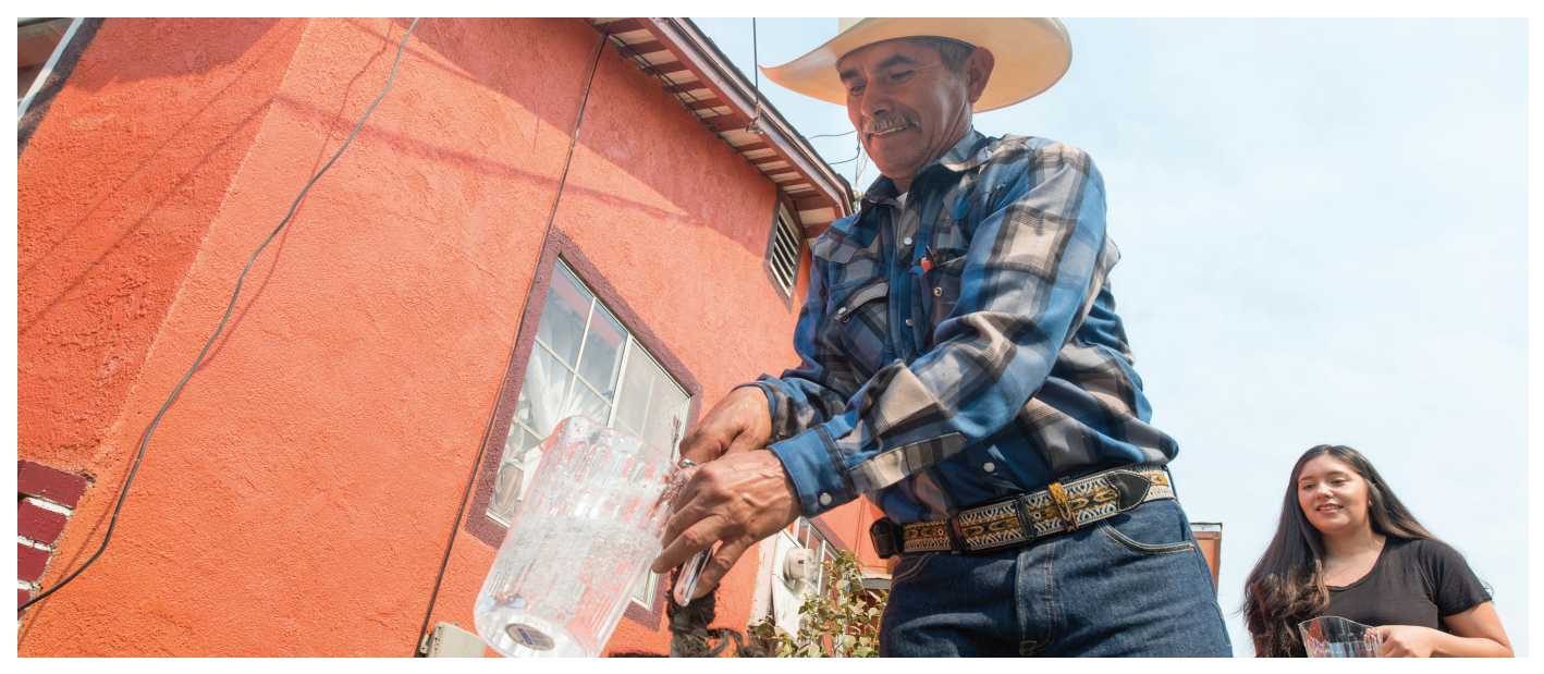
Photo Caption. Ensuring access to clean and reliable drinking water is a focus of the Prop. 1

AB 685, California's landmark human right to water law passed in 2012, emphasized the needs of people living in disadvantaged communities. After the passage of Proposition 1 in 2014 — and as a result of several studies, pilot projects and other efforts — Integrated Regional Water Management (IRWM) partners in 12 funding areas across California's 48 IRWM regions were tasked with effectively engaging members of disadvantaged communities to assess their drinking water, wastewater treatment and flood management needs and wants, and to begin providing effective assistance to meet those needs.