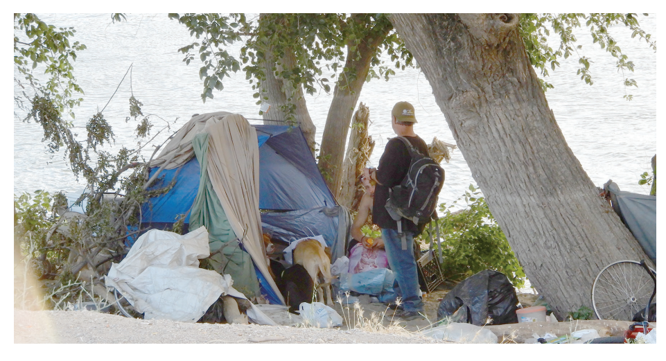
Photo caption. While awareness is growing of the need to provide clean water and sanitation to those experiencing homelessness, finding a comprehensive solution is elusive.

In its 2018 report, Measuring Progress Toward Universal Access to Water and Sanitation in California, the Pacific Institute said, "Adequate water without sanitation is insufficient for meeting the overriding objective of preventing waterborne health threats from chemical contaminants and disease."