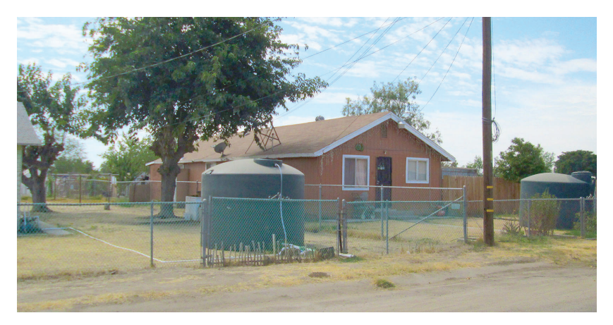
Photo caption. Rural communities dependent on groundwater are vulnerable to water contamination and drought. This East Porterville neighborhood relied on temporary water tanks until they could connect to the city of Porterville's water system.