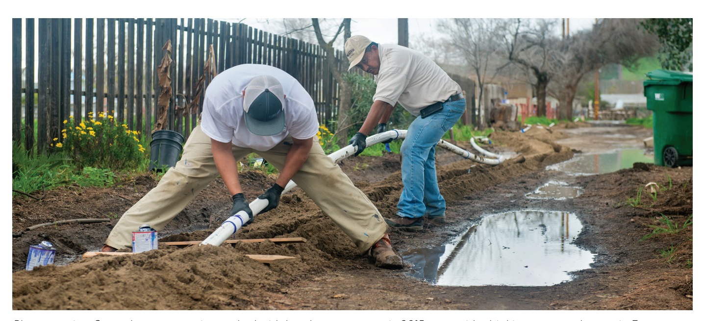
Photo caption. Several state agencies worked with local governments in 2015 to provide drinking water to homes in East Porterville, an unincorporated community in Tulare County where numerous private water wells were contaminated or had gone dry during California's last major drought. Property owners were able to connect to the city of Porterville's water system.

Mandatory consolidation depends on whether the system fails to provide safe drinking water and if consolidation is technically feasible and provides the most efficient and cost-effective means for solving the problem. Although consolidations can reduce costs over the long run, they entail some up-front expenses. Disadvantaged communities can access financial assistance through state bond funds, State Water Resources Control Board loans and some federal programs.