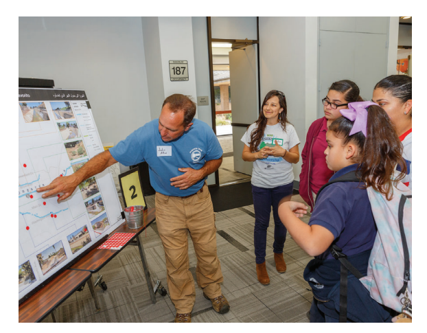
Photo caption. A public outreach meeting for the Healthy Waters for Forester Creek Disadvantaged Communities project, funded by the San Diego IRWM program's Prop. 1 grant.

It is important for state and local agencies to identify the characteristics of disadvantaged communities to ensure their water resources issues are understood and addressed. The California Department of Water Resources uses geographic information system technology to map disadvantaged communities. The maps are searchable based on layers of detail and can zoom in on small geographic areas such as census tracts, block groups and places. Across the Santa Ana River watershed, where about 1 in 3 residents qualifies as economically disadvantaged, California State University, San Bernardino and its project partners are developing a way to more accurately map the complex geographic distribution of the economically disadvantaged because census-block mapping can often overlook neighborhood-scale income disparities.