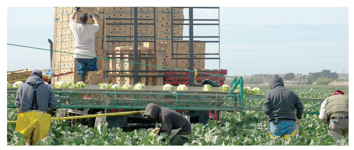
Photo caption. California has about 165,000 indigenous farmworkers and their families.

Eventually, more than 700 homes in East Porterville were connected with the nearby city of Porterville's water supply. The effort was accomplished through the coordinated efforts of the Department of Water Resources, the State Water Board, the Governor's Office of Emergency Services, Tulare County and the community advocacy organizations Self-Help Enterprises and Community Water Center.