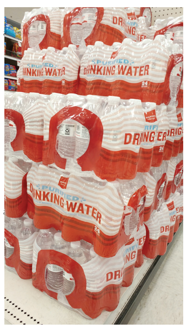
Photo caption. Many residents of disadvantaged communities are forced to use expensive bottled water.

Tap water in the Fresno County community of Lanare, southwest of Fresno, was tainted with unsafe levels of arsenic. An arsenic treatment plant was built with grant funding in 2006, but the plant is inoperative because the small community's low-income residents could not afford ongoing operation and maintenance costs. Help arrived in 2019 with a $3.8 million state grant that paid for two new drinking water wells.