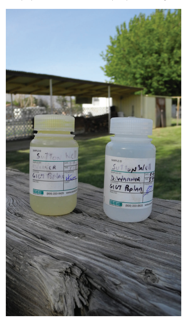
Photo caption. Groundwater contaminated with nitrates and other pollutants is an acute problem in many of California's farming regions.

Solutions are financially out of reach for many poor communities, which lack resources and economies of scale to pay for expensive new treatment and supply facilities. This is true in groundwater-dependent areas where drilling a new well can