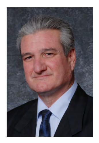
Don Galleano Western Municipal Water District