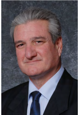
Don Galleano Western Municipal Water District