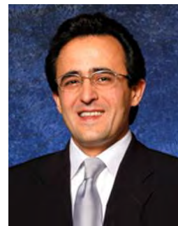
Ali Sahabi Development