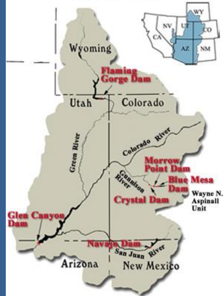
Colorado River Storage Project Mainstem Units