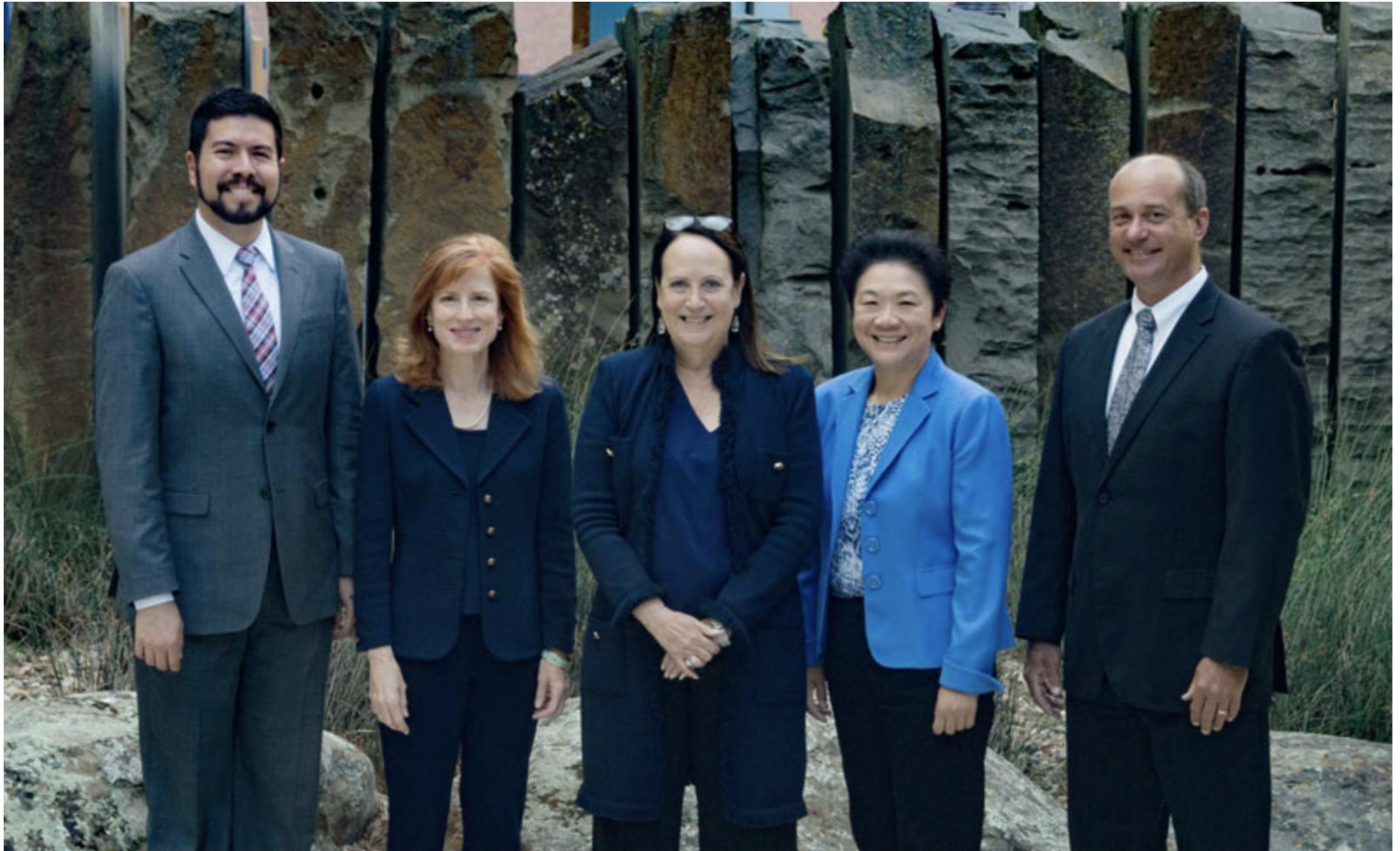
State Water Resources Control Board Members