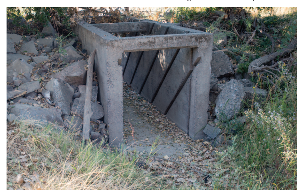
The old fish ladder at the Fremont Weir on the Sacramento River at the Yolo Bypass. There are plans to modify the 2-mile weir so it is more suitable for fish habitat.

"There are still a lot of hurdles for the fish to get through," Abrams said. "There are high levels of mortality."