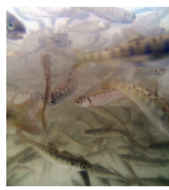
Salmon fingerlings raised at the Oroville Fish Hatchery.

in a way that we can get the water to be significantly colder," he said. "It involves having a little chunk of carryover storage behind the dam – we reduce minimum flows in the early part of year and hold it in reserve