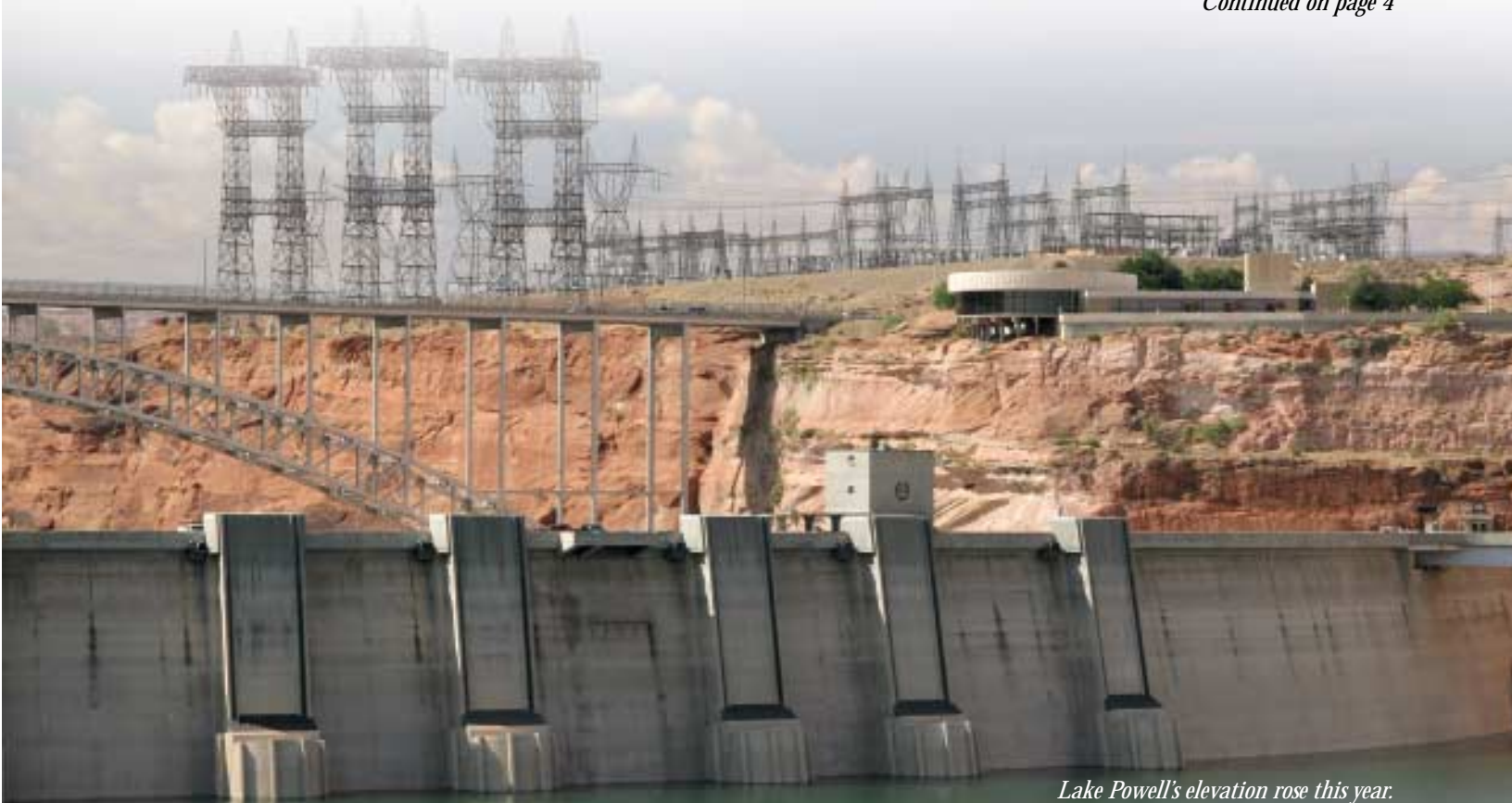
Lake Powell's elevation rose this year.