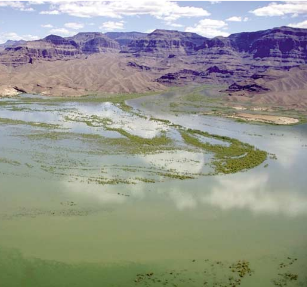
Lake Mead in 1999.

The Las Vegas area has little in the way of local groundwater and is highly reliant on the Colorado River. Under terms of the agreement, SNWA will now be able to develop a portion of its pre-