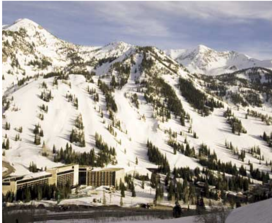
Thanks to abundant snowfall, Utah’s Snowbird resort, above, was open for skiing until June 18.

Over the course of the two years it took to develop the interim shortage guidelines and coordinated reservoir operations, Reclamation staff attended more than 75 meetings with representatives of the seven basin states and other