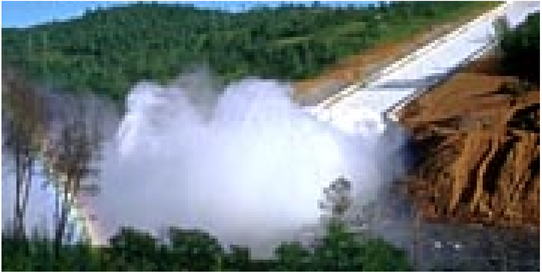
Oroville Spillway Flood Management Release