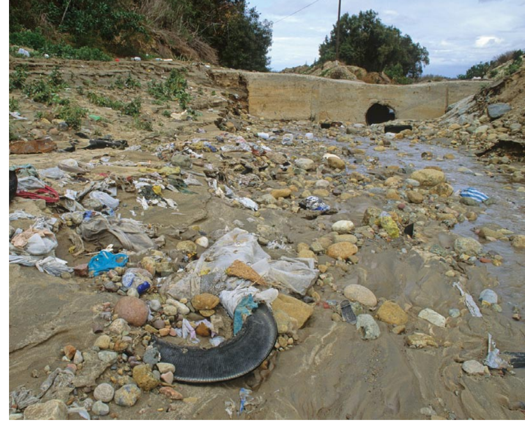
Litter and trash plague the Tijuana River Estuary near San Diego.

The question has been whether to upgrade a secondary treatment facility near San Diego to treat 25 million gallons a day (mgd) or to build 59 mgd capacity secondary facilities in Mexico under a public/private partnership known as the Bajagua Project. The estimated capital cost for the 25 mgd U.S. facility is $101 million in 2008 dollars compared to the Bajagua estimate of $195.6 million for construction of a 59 mgd facility in