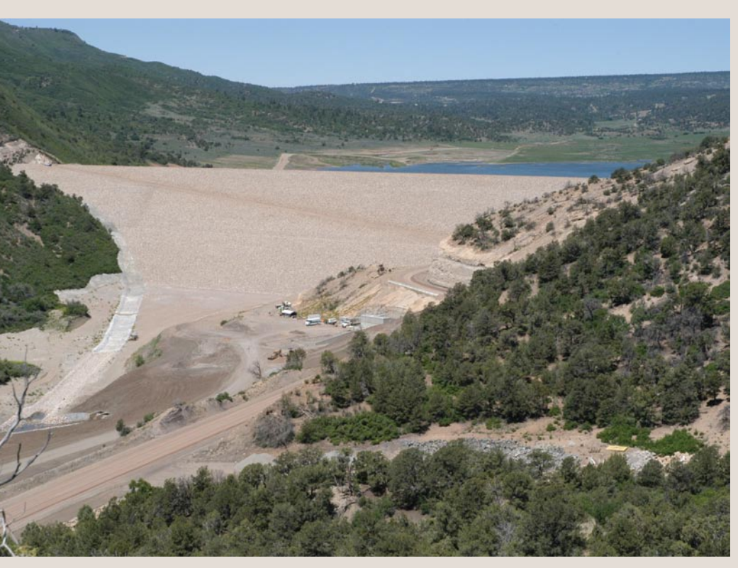
The completed Ridges Basin Dam contained 1,000 acre-feet of water from winter snow melt in July 2008.

Forty years after it began, the Animas-La Plata Project in Southwestern Colorado and Northwestern New Mexico is 97 percent complete and being touted as an important source of water for the region.