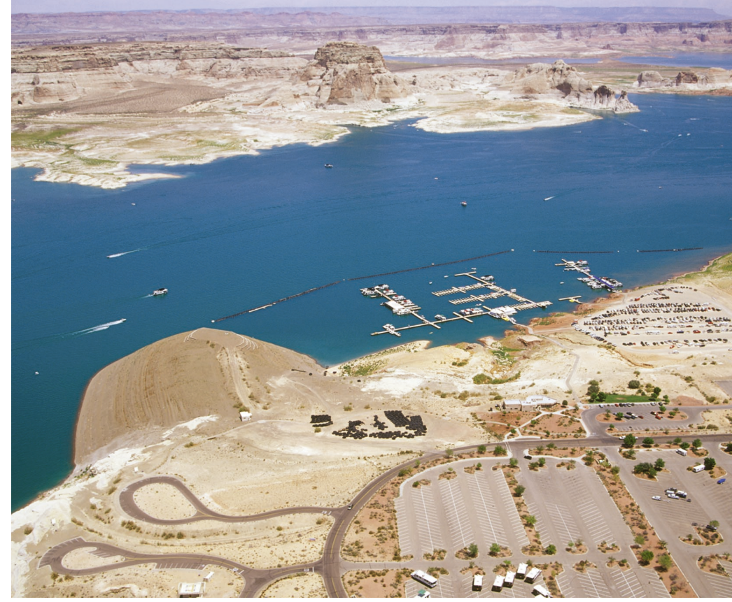
Drought has reduced water storage in Lake Powell by half.

Through voter-approved bond money, California DWR administers grants to local water agencies for integrated regional water management plans (IRWMPs), a process designed to promote cooperative, regional approaches to water planning and find areas of mutual benefit. IRWMPs emerged to counter the past practice by which individual water agencies pursued smaller, localized water projects - often in competition against neighboring agencies for water and grant funding. As water supplies tighten and the future becomes less certain, it is expected that IRWMPs will reflect the flexibility and diversity officials say is needed.