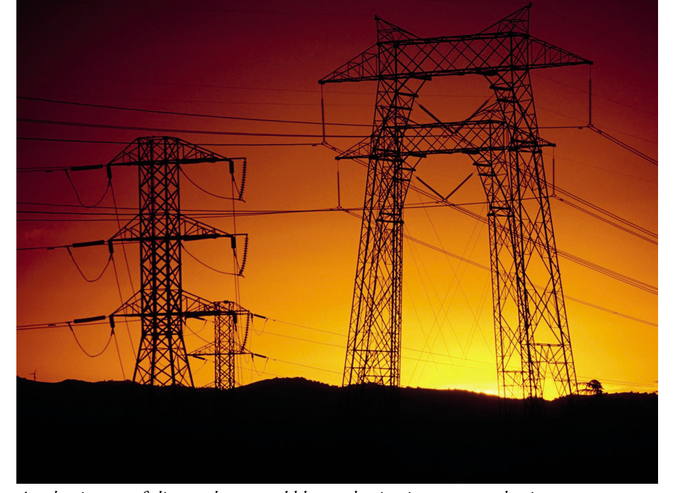
Another impact of climate change could be a reduction in energy production.

Record springtime temperatures in the Upper Colorado Basin and the hotter-than-usual June to September in Phoenix (which recorded nearly 50 days of temperatures at 109° F or greater) are signals of a changing climate and not part of the normal trend of variation, according to Udall. "When this drought started it was easy to believe that 'Hey, this is just a historical norm drought, we've seen these before,' but what is increasingly clear is that this is a drought